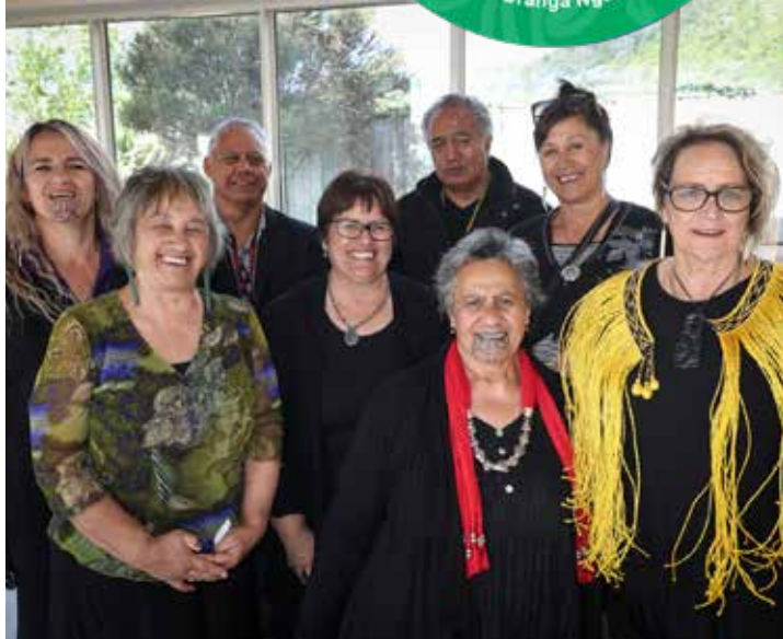
Staff and whānau enjoying the Whakatāne event.

Those being recognised in Tauranga came from 96 different roles and were part of over 129 departments which speaks to the wide range of diversity that we have across the Bay of Plenty health system.